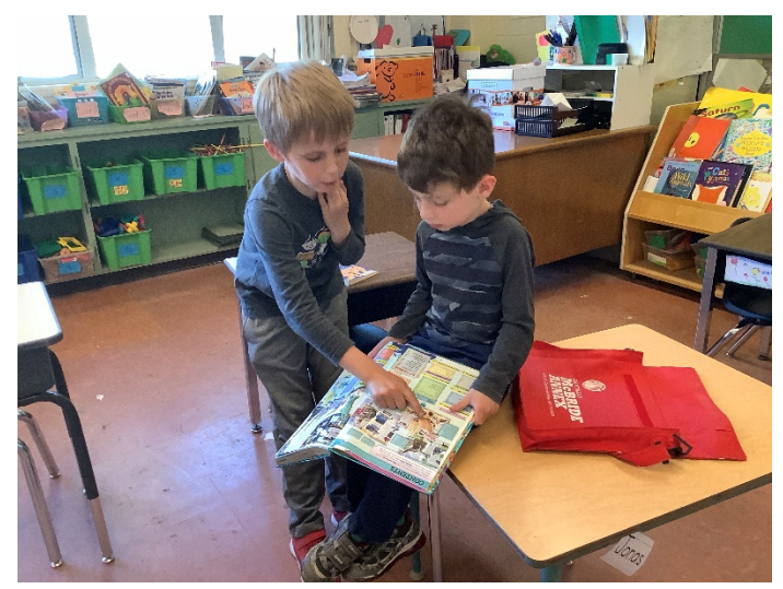
Div. 2 Reading