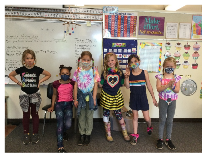
Above & Below: Rainbow Day