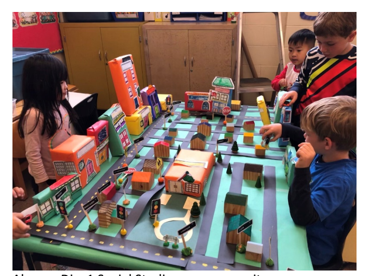
Above: Div. 1 Social Studies on community