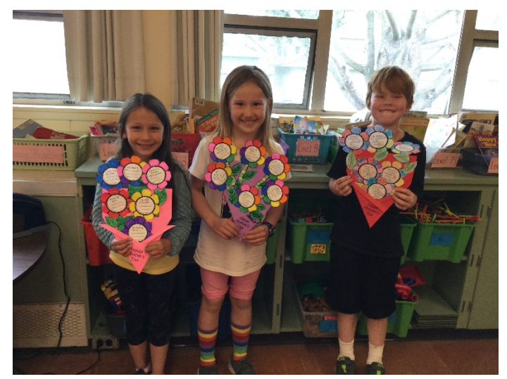
Div. 2 Mother's Day project