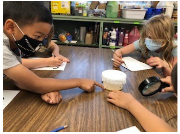
Above: Div. 4 science