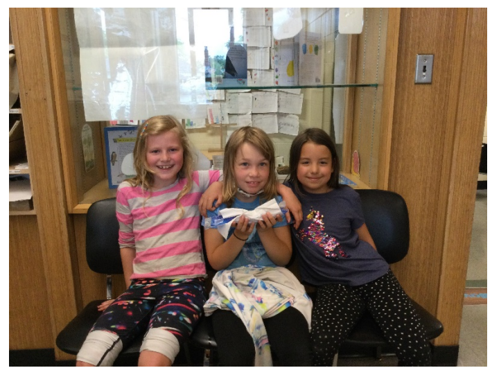
Ice Pack from the office