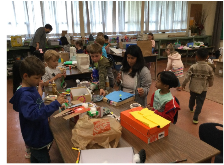
Above: Div. 1 working with their box project